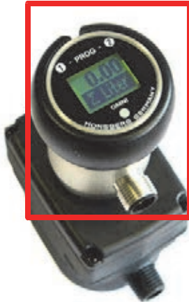
Counter for flow transmitters: